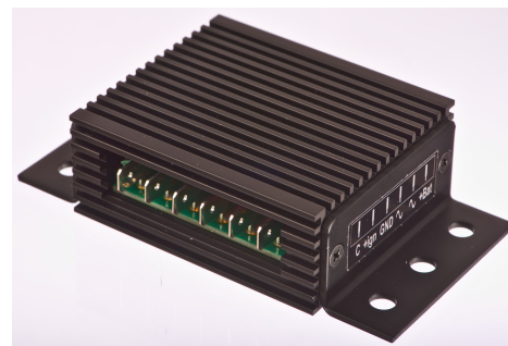
Figure 1 Connections of the REG1.

The charge control light is optional for this regulator. If the bike does not have a charge control light, just leave the C connector unconnected.