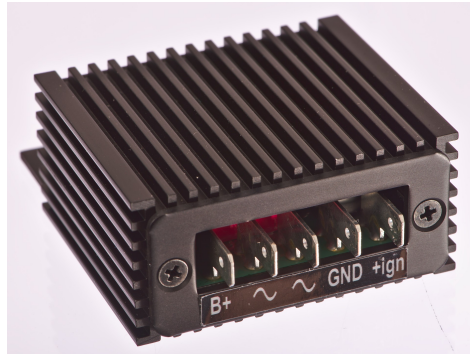
Figure 1 Connections of the REG1.