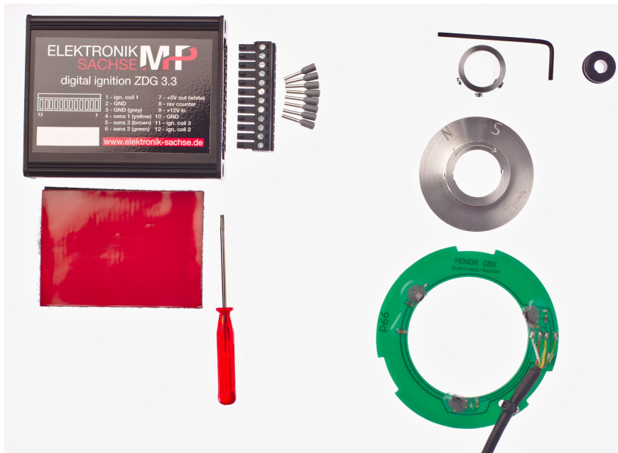
Figure 1 Scope of delivery.