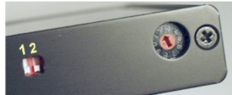
Figure 4 DIP switches and rotary switch.

The rev limiter DIP switch No. 2 is next to DIP switch No. 1 and adjusts the frequency of the electronic tachometer that can be connected to terminal connection 8 of the ignition box. If no electronic tachometer is connected this switch can be ignored.