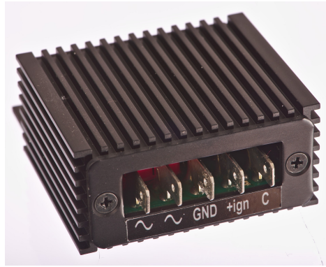
Figure 1 Connections of the REG2.