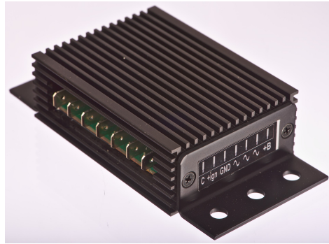
Figure 1 Connections of the REG1.