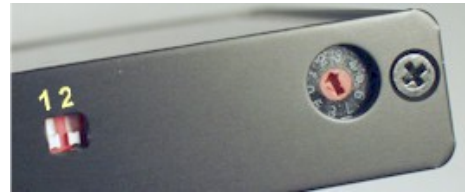
Figure 3 DIP switches and rotary switch.

We ship the units with a suitable curve for the purchased model as default. If you don’t want to fiddle with the system, just leave it there. It is a conservative curve with not too aggressive advance so it does a good job as default curve for a variety of bike configurations. Otherwise if it’s a stock bike, check the manual for advance setting the manufacturer recommends and select a suitable ignition curve based on that.