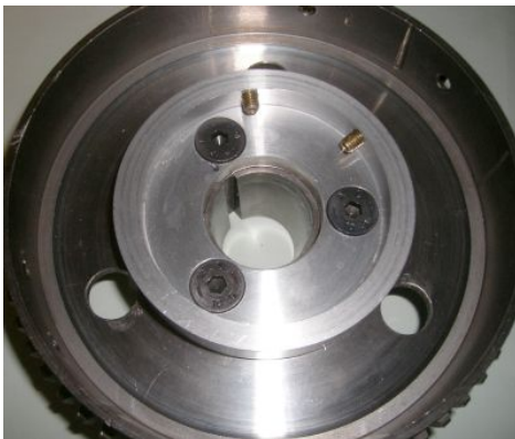
Mounting the magnet disk in the original flywheel.