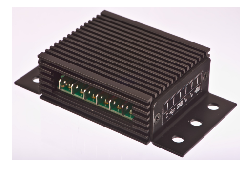
The charge control light is optional for this regu-