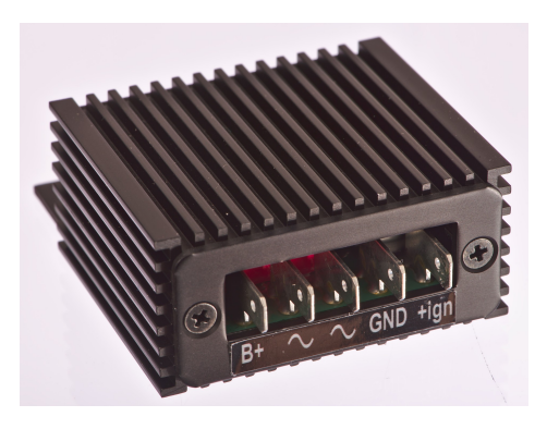
Figure 1 Connections of the REG1.