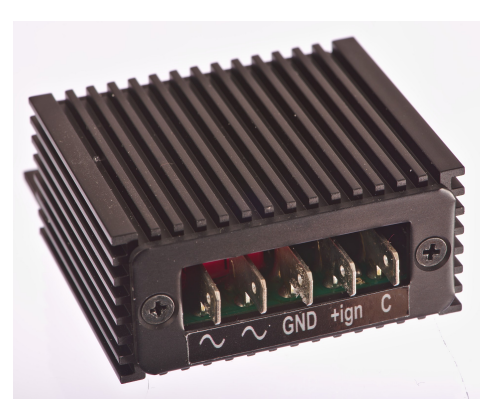
Figure 1 Connections of the REG2.