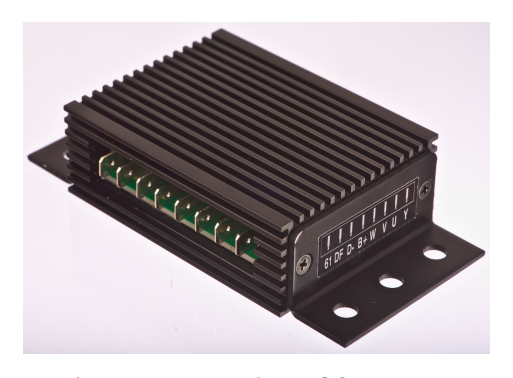
Figure 2 Connections of the REG8-P.

The charge control light is not optional for this regulator. The regulator utilises the charge control light current to generate a magnetic field in the field winding. If no charge control light is used, a 68\,\Omega , 5\,W resistor can be used instead. Also if a LED is used instead of a traditional bulb, the current is